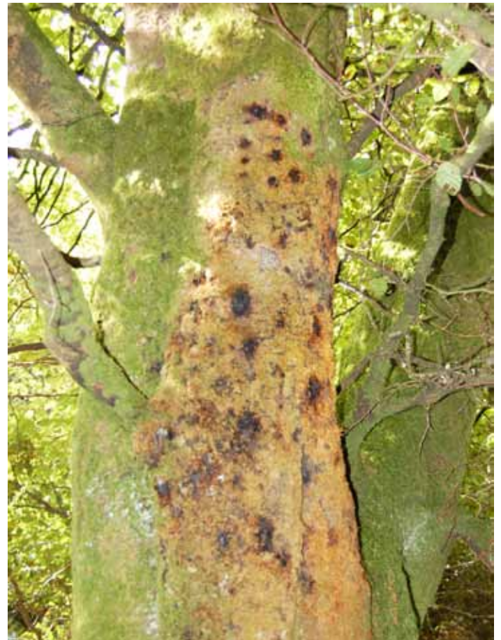
Figure 3 Bleeding cankers on a beech tree caused by Phytophthora ramorum