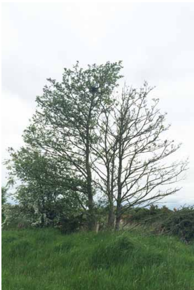
Figure 7 Dieback of Alder caused by Phytophthora alni

Other Phytophthora species detected in Irish forests by the PHYTOFOR researchers include Phytophthora pseudosyringae , Phytophthora cinnamomi , Phytophthora alni (Fig. 7), Phytophthora gonapodyides and Phytophthora chlamydospora . The first three species listed are plant pathogens, with P. pseudosyringae emerging as a worrying threat to Irish forests following its detection in Japanese larch, European beech and Southern beech in Ireland. The final two species listed are usually found in streams and rivers, where they function as decomposers of decaying plant litter and sometimes as opportunistic pathogens. One significant trend world-wide, which has also been noted in the PHYTOFOR research, is the increasing number of invasive alien Phytophthora species being detected in natural habitats. Many of these pathogens are being brought in to the country on infected plants, and could represent a serious threat to Irish ecosystems in the near future.