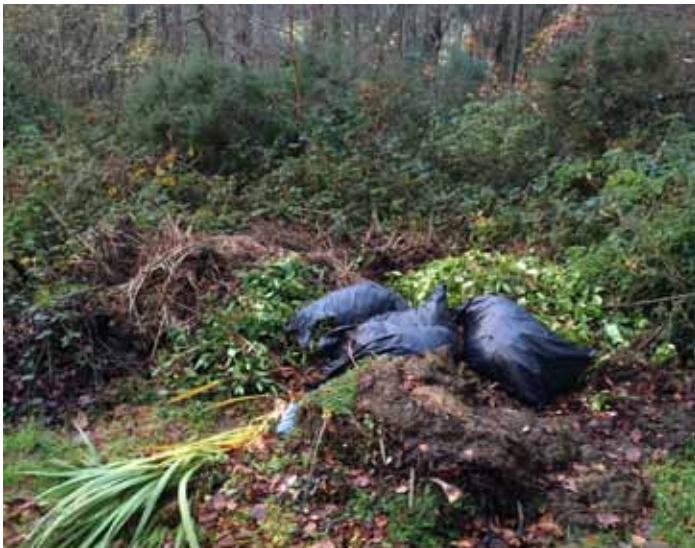
Figure 5 Illegal dumping of horticultural waste at a forest entrance