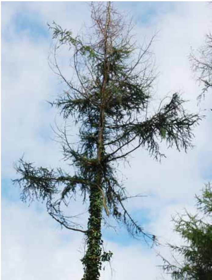
Figure 2 Severe dieback in the crown of a Japanese larch tree caused by Phytophthora ramorum