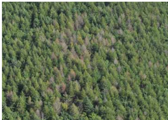
Figure 1 Aerial view of Japanese larch forest affected by Phytophthora ramorum in Ireland

Symptoms of infection on Japanese larch often become evident during the spring and summer. The time between notice of first symptoms and tree death can be rather short, and this seemingly rapid mortality of larch trees has led to "Sudden Larch Death" being used to describe the disease epidemic (Fig. 1). Infection on individual larch trees can be indicated by dieback of the crown (Fig. 2), resinous cankers on the trunk, excess cone production and by blackening and retention of needles. On Rhododendron , lesions along the midrib and at the tip of the leaf, stem decay and dieback can be a sign of P. ramorum infection. On European beech, P. ramorum typically manifests itself as bleeding cankers (Fig. 3).